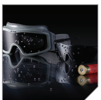
ESS Ballistic Protection ESS' extra-thick Polycarbonate lenses resist impacts—in this case blasts from a 12-gauge shotgun firing #6-shot from 10 meters—dimpling but not penetrating the lenses