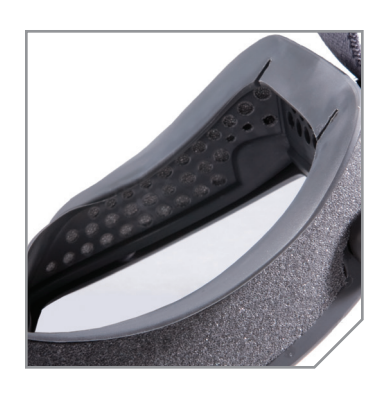
Striketeam WF™ Economy model with smooth interface