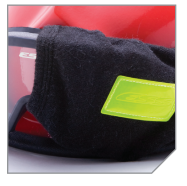
Nomex® HeatSleeve<sup>TM</sup> Optional protection for goggle & lens, guards against scratches & heat