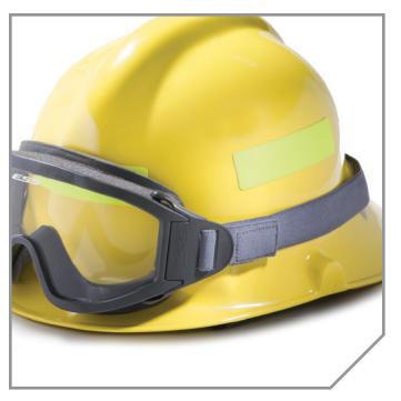
Strap System 2 Velcro® tabs secure strap to any type of helmet. Goggles can be stowed on front of helmet